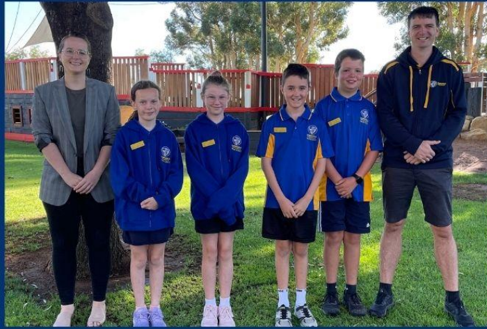
Young Environmental Leaders